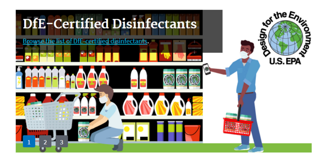
Figure 4. Learn more about Design for the Environment labeled disinfectants.

Safer active ingredients for disinfectants currently available include hydrogen peroxide, citric acid, lactic acid, and ethanol.