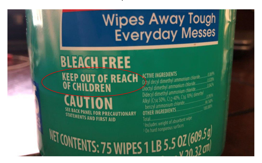
Figure 1. Disinfectant product with "KEEP OUT OF REACH OF CHILDREN".

1. Disinfectant wipes are EPA registered antimicrobial pesticides designed to kill or inactivate microbes (germs). Many have "KEEP OUT OF REACH OF CHILDREN" (Figure 1) clearly stated on containers. The newsletter authors do not recommend students handle disinfectant products in school at all.