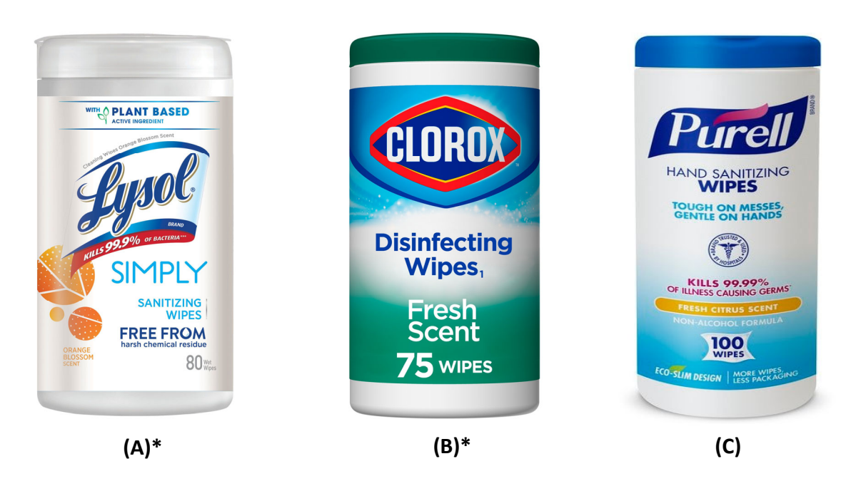
Figure 2. Many types of wipes are available for purchase.

warning. (B) EPA registered disinfectant wipes for non-food-contact surfaces. The wipes should be used so the surface remains wet for a 4-minute contact time*. Following the contact time, the surface should be rinsed thoroughly with potable water if contact with food is likely. Hands must be washed well with soap and water, even if chemically resistant gloves are used. The product has a "KEEP OUT OF REACH OF CHILDREN" warning. Contact times vary between surface disinfectants* and are stated on the label. (C) FDA regulates hand sanitizers since these are over-the-counter products for your hands and are <u>not</u> designed for cleaning surfaces. The product has a "Flammable" and "KEEP OUT OF REACH OF CHILDREN" warning. Please note, not all hand sanitizers are legitimate products. To check if your hand sanitizer is listed on the FDA DO NOT USE list go to: <a href="https://www.fda.gov/drugs/drug-safety-and-availability/fda-updates-hand-sanitizers-consumers-should-not-use#products">https://www.fda.gov/drugs/drug-safety-and-availability/fda-updates-hand-sanitizers-consumers-should-not-use#products</a>.