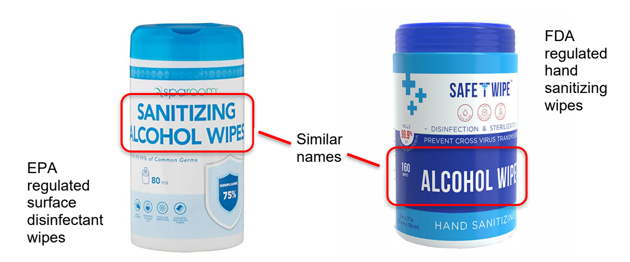
Figure 3. Both products are labeled as Alcohol Wipes , but the product on the left is an EPA regulated disinfectant for surfaces, and the product on the right is an FDA regulated hand wipe product.

Products for " surface " sanitizing (EPA antimicrobial pesticide) and " hand " sanitizing (FDA over-the-counter drug) may look very similar (Figure 3). Some have <u>different ingredients</u>, while some have similar ingredients. However, these products are regulated by two different agencies, and are NOT interchangeable.